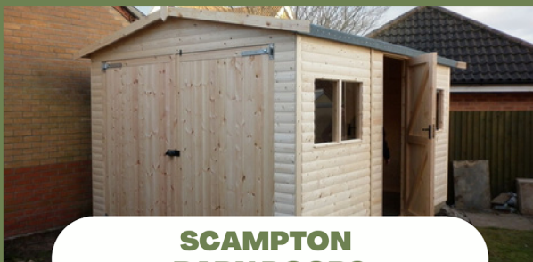
SCAMPTON BARN DOORS