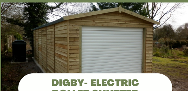
DIGBY - ELECTRIC ROLLER SHUTTER