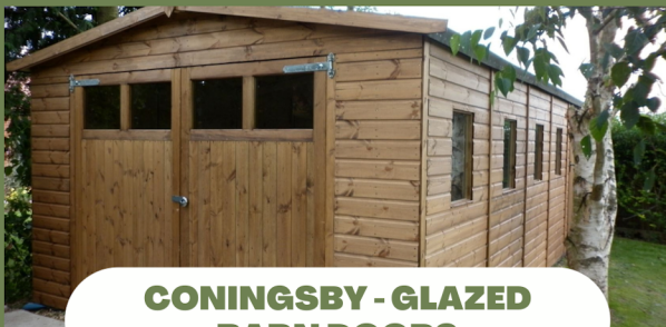
CONINGSBY - GLAZED BARN DOORS